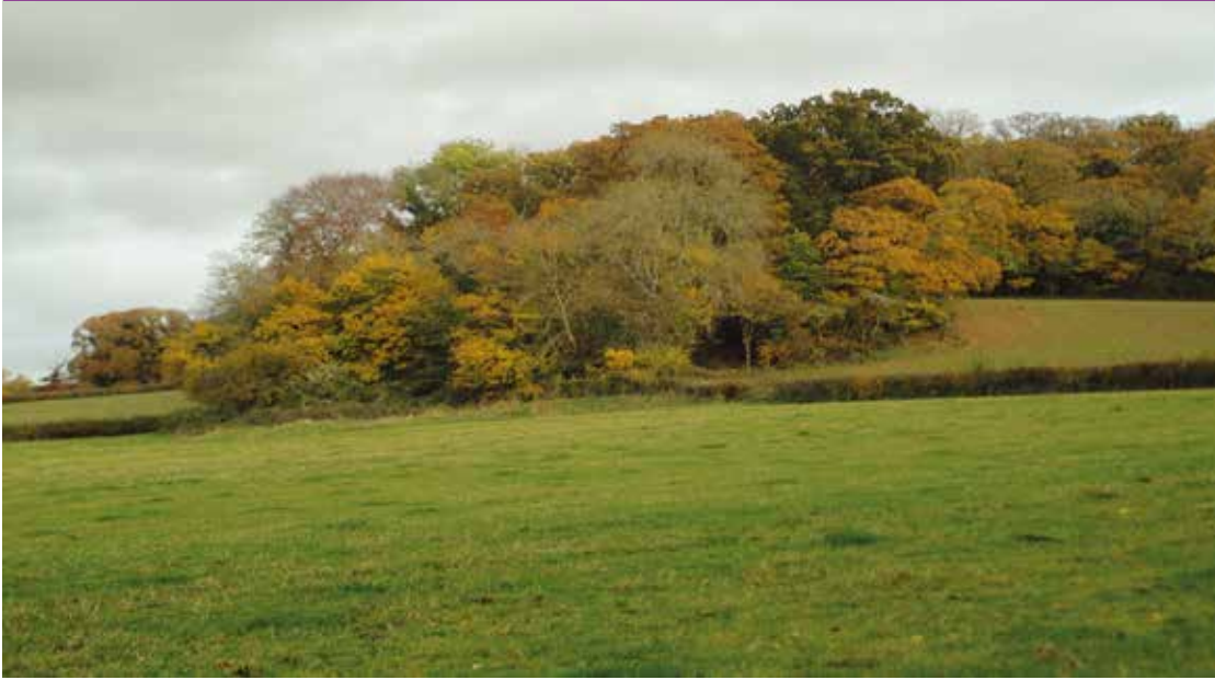
Photo: Surrounding Countryside

Chudleigh is an ancient town on a limestone ridge, meaning that the landscape is riddled with caves and old quarries. Lanes and footpaths crisscross the rich countryside which is a Special Area of Conservation for greater horseshoe bats.