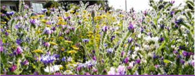
Create your own bat friendly space at home

Everyone can help bats by creating a bat friendly garden. Planting wildflowers in your garden, for example, will attract more insects, which in turn attracts bats and other wildlife. Leaving a small log pile will provide shelter for insects and other creatures such as hedgehogs. Download our 'Stars of the Night Sky booklet' from the website for lots of ideas.