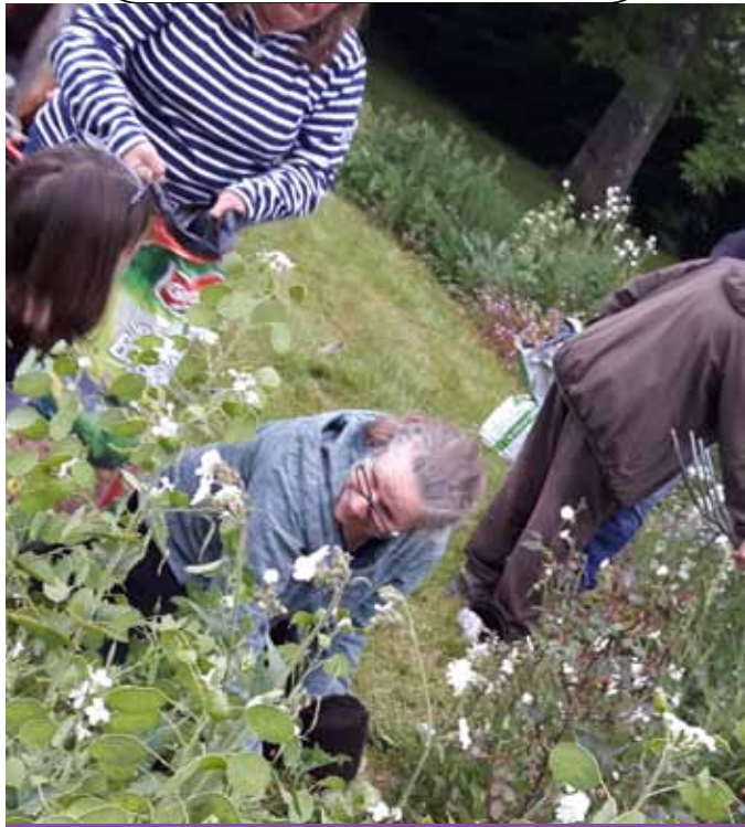
Chudleigh Bat Garden