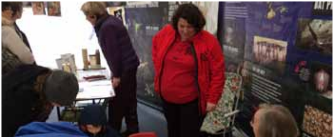
Beer Bat Day

BAT FACT: A maternity roost is where baby bats (pups) are born and raised