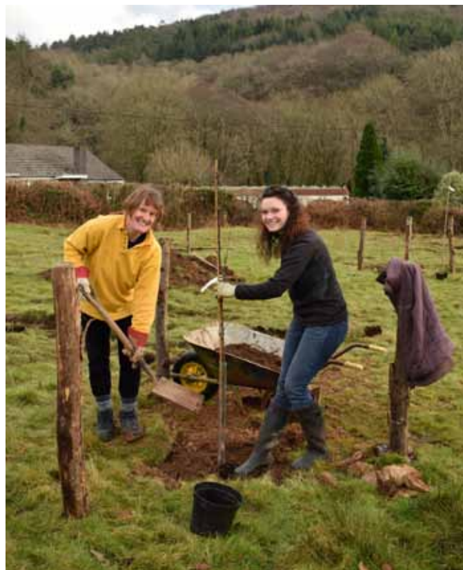
Orchard Planting with Volunteers

The bat project is able to provide small grants towards works that help the greater horseshoe bat—these BatWorks grants can be used to: buy tools and equipment to help manage sites; for roost improvements; to improve land to make it more bat friendly; or to raise awareness of the bats in the local community. In Year 2 over £16,000 was granted to 13 schemes, and more projects are lined up to be funded over the next 3 years. If you are within one of our target areas and have an idea that will benefit greater horseshoe bats, then please talk to us and see if we can help.