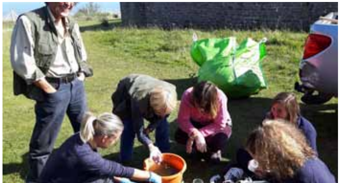
Workshop on Dung and Parasites

County Wildlife Sites represent some of the best quality habitats in the county. Spaces like these are important for wildflower species, and for the insects, birds and small mammals (including bats) that rely on them to provide somewhere to live and food to eat. The team have found two new sites which are of County Wildlife Site standard, and we are hoping that they will get designated soon.