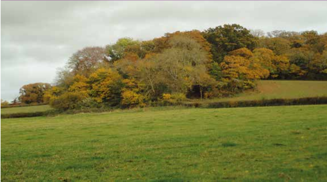
Photo: Surrounding Countryside

Chudleigh is an ancient town on a limestone ridge, meaning that the landscape is riddled with caves and old quarries. Lanes and footpaths crisscross the rich countryside which is a Special Area of Conservation for greater horseshoe bats.