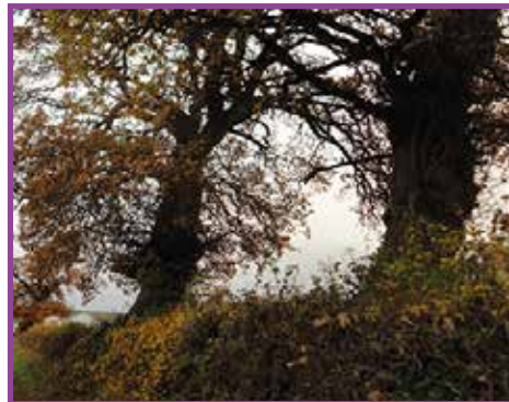
Photo: Hedgerow with large trees