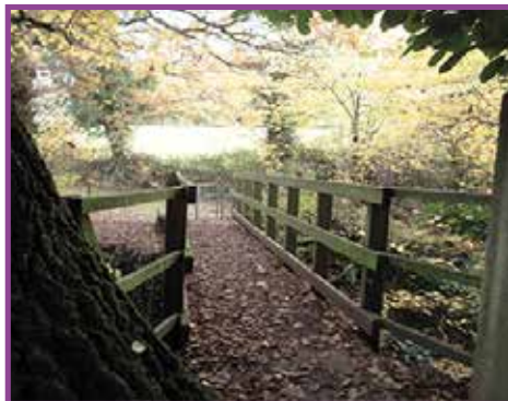
Photo: Country path