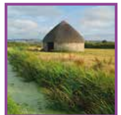
Photo: Linhay Braunton marsh