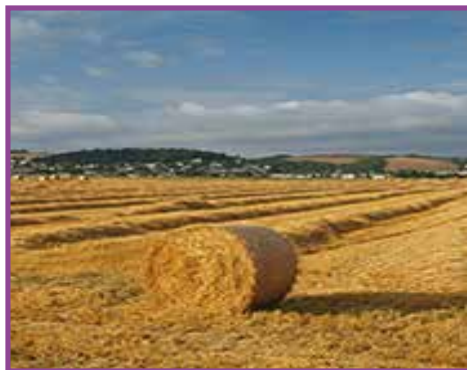
Photo: Braunton Great field