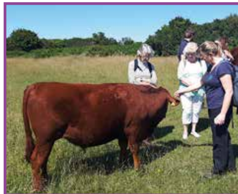
Photo: Cattle grazing