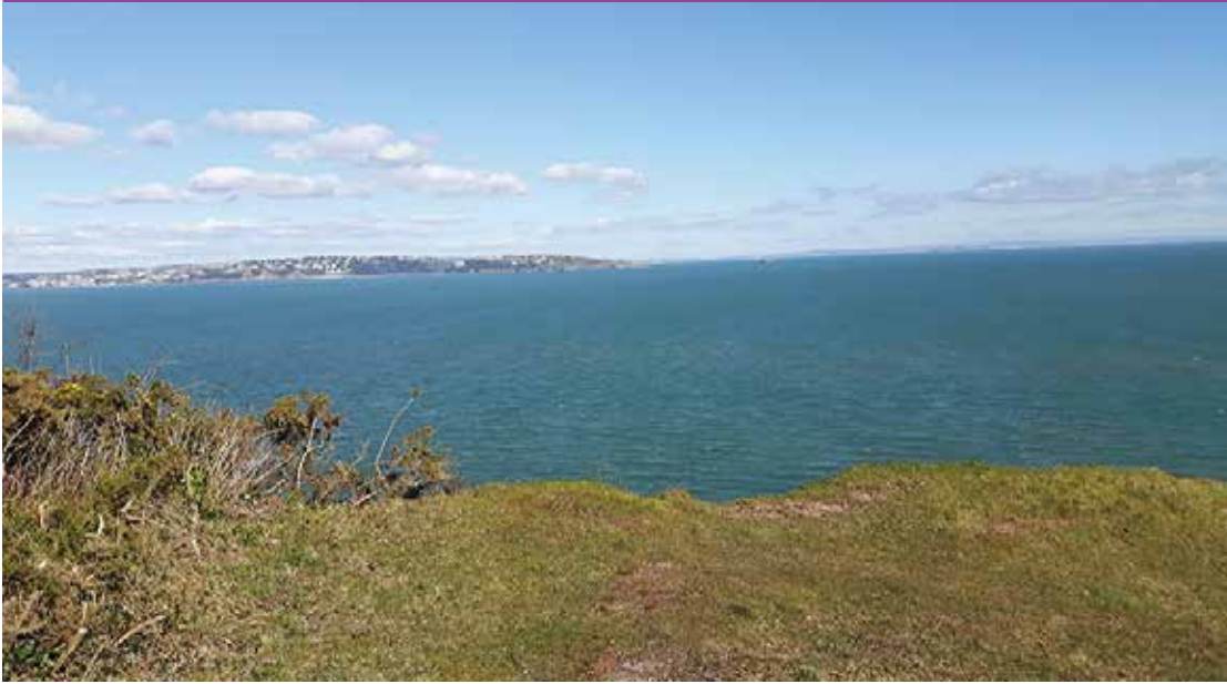
Photo: View from Berry Head