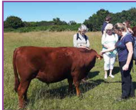
Photo: Cattle grazing